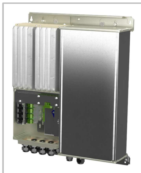
SYSTEM WITHOUT COVER AND OPEN SYSTEM BOX